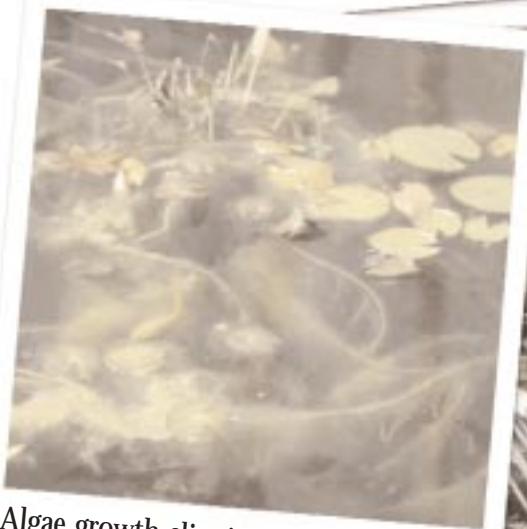
Algae growth clinging to aquatic plants.