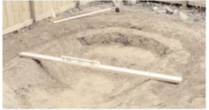
Leveling the pond during construction.