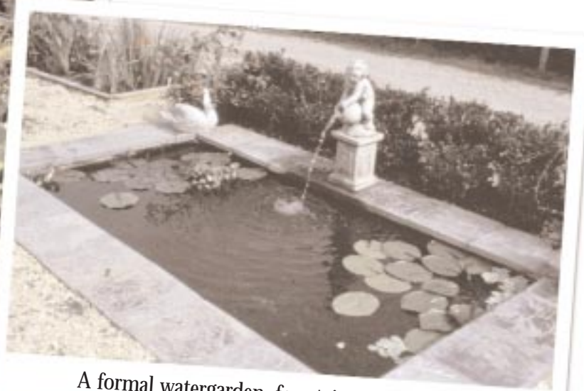
A formal watergarden, fountain and waterlilies