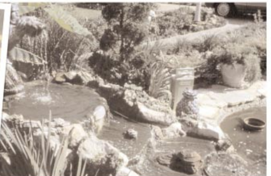
A less formal water garden with natural materials and an irregular shape.