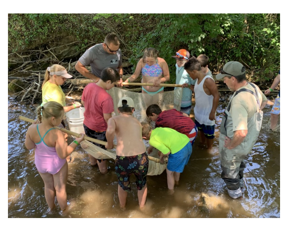
Come and Join the Fun!